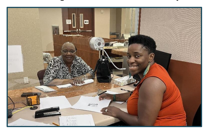
Figure 3 - An intake specialist meets with a tenant during an eviction diversion intake appointment.

LVJC and Clark County Social Services established a formal partnership to build access to financial and social services directly into the eviction court process. Tenants who are enrolled in the diversion program receive a <u>Court Order</u> directing them to attend an eviction diversion intake appointment. The Order explains what the eviction diversion program is, what to expect at the intake appointment, and what documents to bring to expedite the application process for services (see Figure 4). Intake appointments are scheduled Monday-Thursday from 7:30am -6:30pm, allowing tenants to come to court outside of regular work hours if necessary.