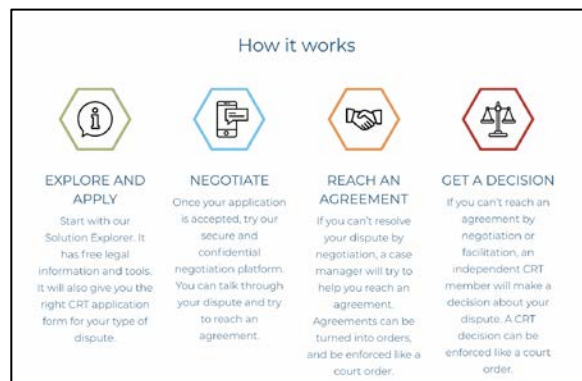
Figure 2 - CRT dispute resolution process

During system design, the CRT development team anticipated that peak usage would be after business hours and on weekends. However, web analytics show that the majority of users are accessing CRT services during traditional business hours, and more often than not, through tablets and smartphones.