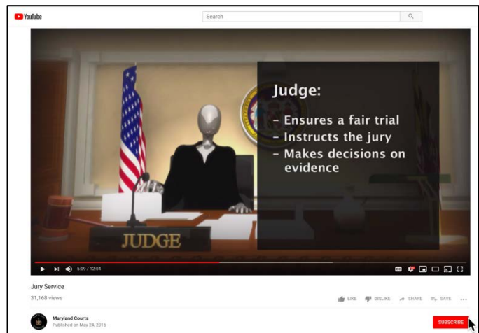
Figure 1 - Maryland Courts Jury Training Resource

Video is a uniquely powerful medium for educating, entertaining, and motivating. Not only do viewers retain a higher percentage of information communicated via video, but they are also significantly more likely to re-post and share video content. Video improves search engine optimization (SEO) page ranking, as well. YouTube is currently the dominant platform in the video-sharing space. More than half of all video content is viewed on mobile devices, a percentage that is expected to continue rising. 10