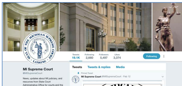
Figure 2 - Michigan Supreme Court Twitter feed

With a 280 character-limit for posts and the ephemeral nature of its notifications, Twitter is a platform suitable for short, timely announcements. Word travels fast via Twitter. A single “tweet” on a particularly urgent or controversial topic can generate a sudden spike in activity referred to as a “Twitterstorm.”